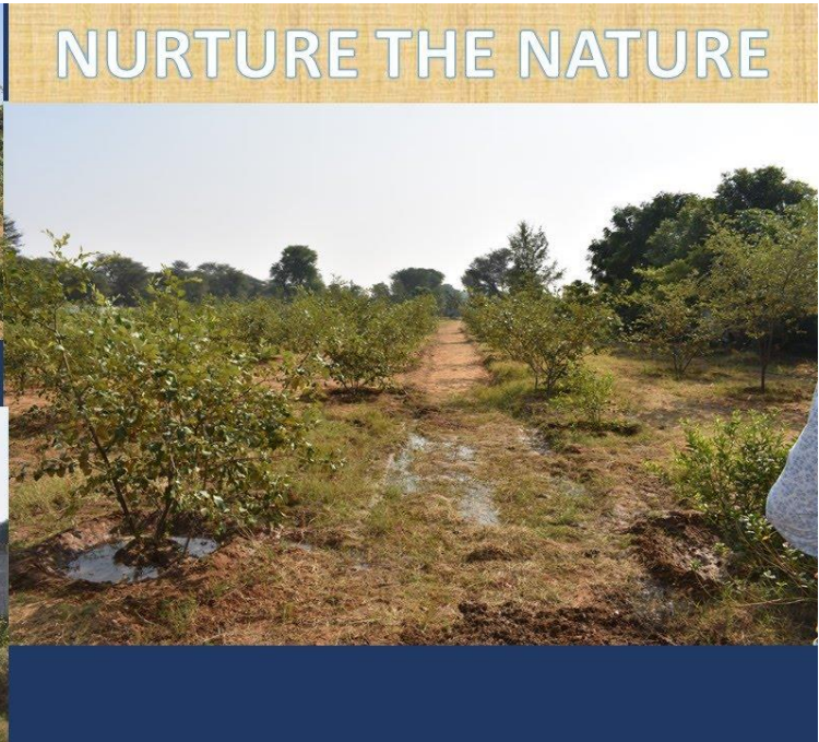
Plantation on Earth Day (22/04/2021)