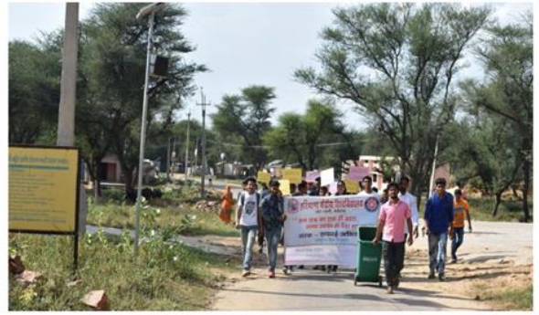
Rally at the Adopted Village