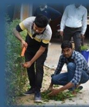
Swachata Campaign at Mahendragarh (14/10/2017)